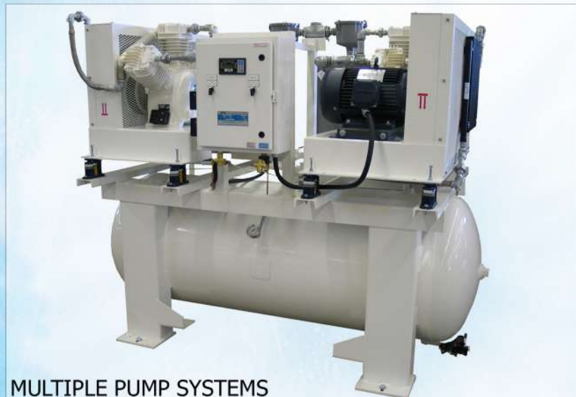
MULTIPLE PUMP SYSTEMS